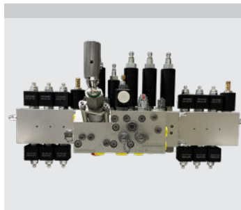
Standardised hydraulic architecture