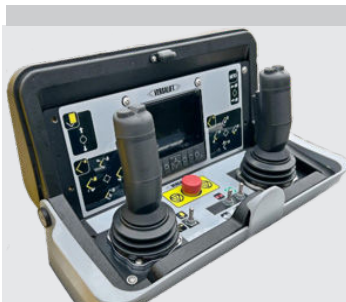
Versalift control systems XPC