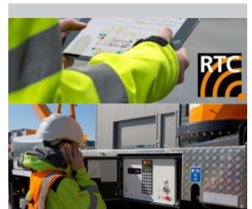
Remote monitoring via Real Time Connect as standard