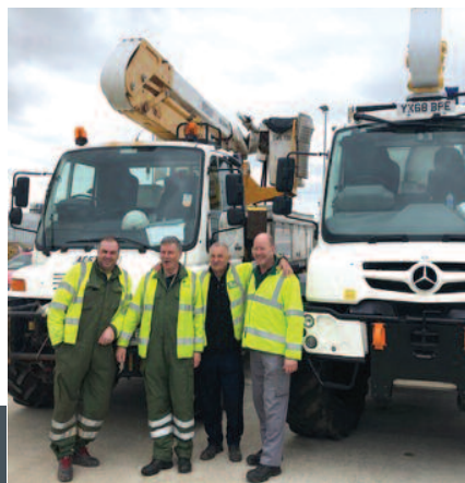
The Scottish Power team with their new and old Unimogs

One of 12 units has been delivered for use by depots across Scotland and the North West. The Kilmarnock team were happy to see the latest Unimog fitted with their preferred VOE 36 insulated platform and bespoke locker layout and options.