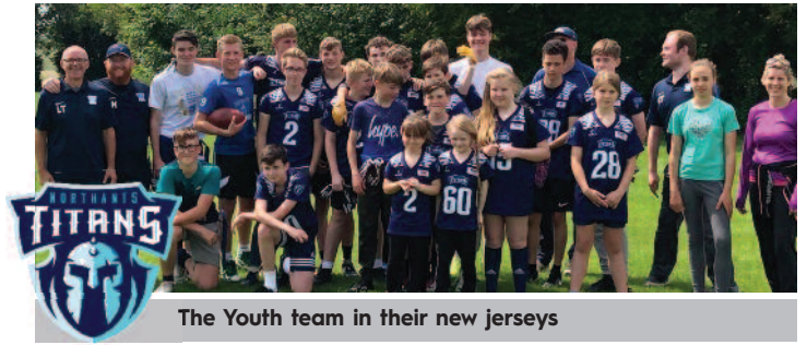
The Youth team in their new jerseys

The youth players of Northants Titans American football team have new jerseys for the current season thanks to Versalift which has sponsored the club. The blue jerseys look fantastic with the new Versalift United Kingdom logo on the front and back. Sponsorship of this type supports local clubs and allows youngsters to take up the sport.