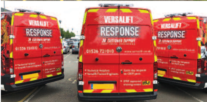
New service vans supporting 7,000 Versalift platforms in the UK & Ireland