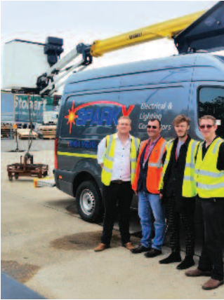
Forming relationships with the University of Northampton's engineering talent pipeline.

Versalift is collaborating with the University of Northampton with a Business Innovation Grant to develop an automated process for stability loadings. The grant of £5k is open to businesses in the local area to work together with academics from the University of Northampton to boost growth and development of ideas.