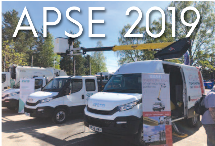
Versalift and Iveco have a successful show

Versalift returned to the 2019 APSE Waste and Grounds Seminar in Aviemore Scotland sharing a stand with CFS, the Iveco dealer for Glasgow. This successful partnership resulted in a number of leads being taken and lots of customers interest in the latest VTL platforms.