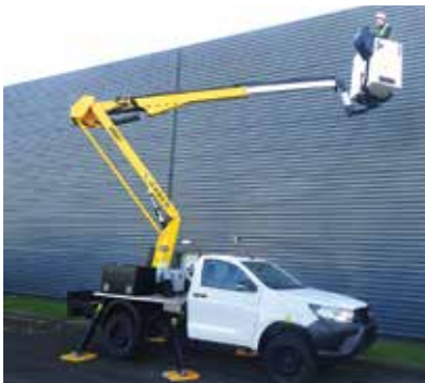
Fitted with LV insulation as standard, the LAT135-H E6 features a stronger, lighter boom and a re-engineered pedestal.