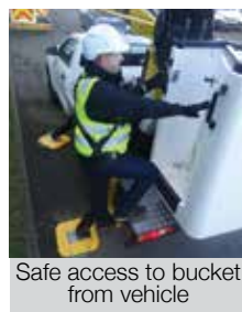
Safe access to bucket from vehicle