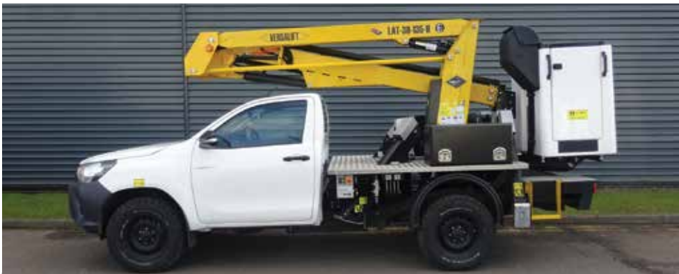
Low travel height, less than 2.6 metres.