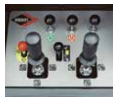
Easy to use fully hydraulic proportional control