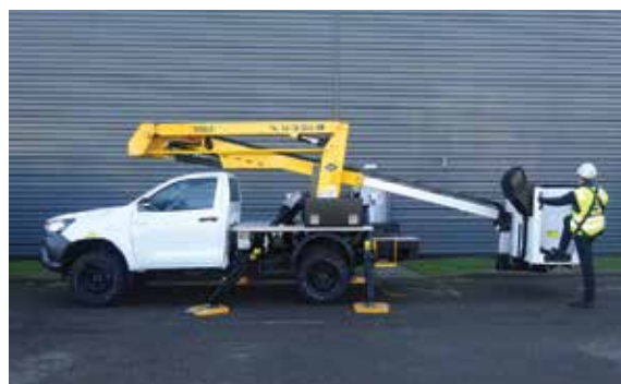
Safe access to bucket from ground