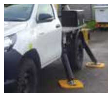
Double A-frame outriggers (front + rear) for narrow, compact set-up