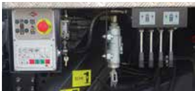
Hydraulic, 12V DC emergency ground controls and emergency hand pump