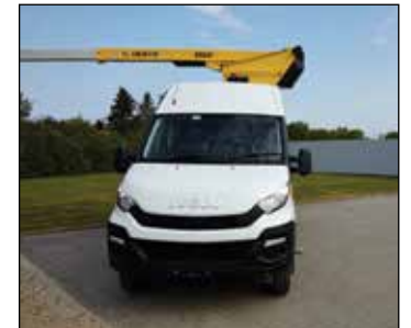
No tail swing outside the mirrors of the vehicle for improved safety