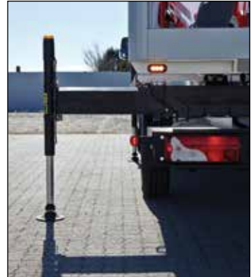
Compact H-frame outriggers

The photographs in this brochure are for promotional purposes only. Specifications are subject to change without notice.