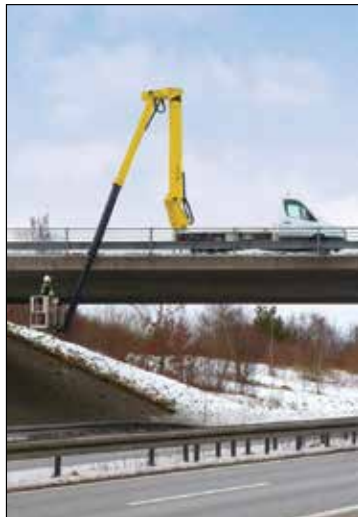
Ability to access below ground