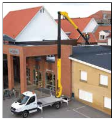
The ability to work over rooftops to access difficult to reach areas is aided by a flat bottomed basket