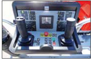
Easy to use full proportional (FPC) CANbus controls with display