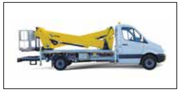
Low travel height