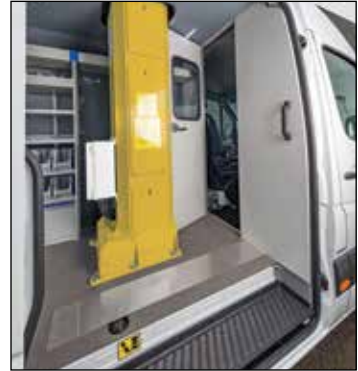
Optional direct access to load area from cabin

The photographs in this brochure are for promotional purposes only. Specifications are subject to change without notice.