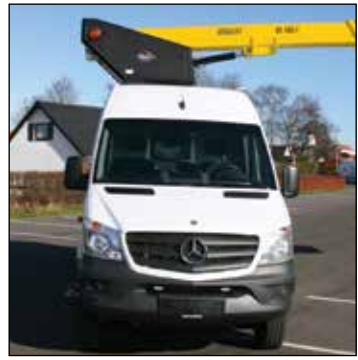
No tail swing outside the mirrors of the vehicle for improved safety