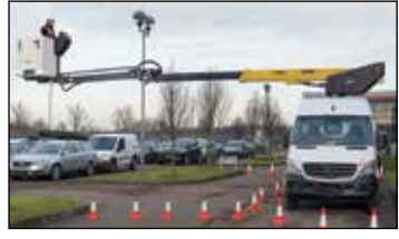
Up to 9.5m maximum outreach