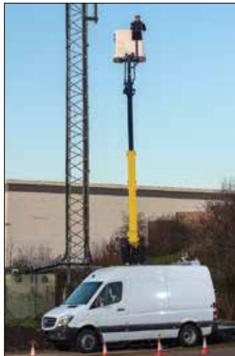
Platform mounted on a 5.0T GVW Mercedes Sprinter