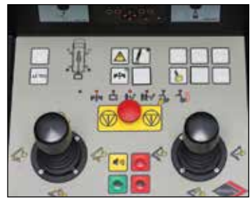
Sophisticated FPC controls with optional Home function for self docking