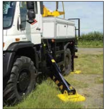
Improved stability with proven A-frame and radial outrigger system