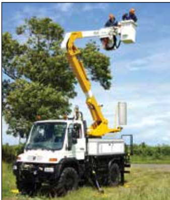
Efficient operation of materials handler with twin bucket system