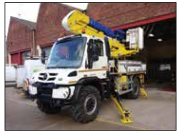
Mounted on a Mercedes Unimog U423 Euro 6

The photographs in this brochure are for promotional purposes only. Specifications are subject to change without notice.