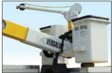
Jib and winch provides up to 670kg lifting capability