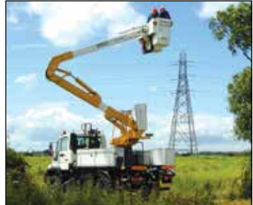
Can work on live network up to 46kV CAT C