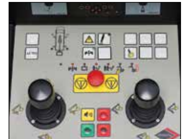
Sophisticated FPC controls with optional Home function for self docking