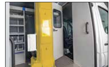
Optional direct access to load area from cabin

The photographs in this brochure are for promotional purposes only. Specifications are subject to change without notice.