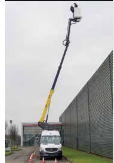
17.1m double telescopic boom on compact chassis