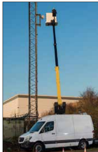
Platform mounted on a 5.0T GVW Mercedes Sprinter

The photographs in this brochure are for promotional purposes only. Specifications are subject to change without notice.