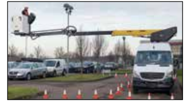
Up to 9.0m maximum outreach