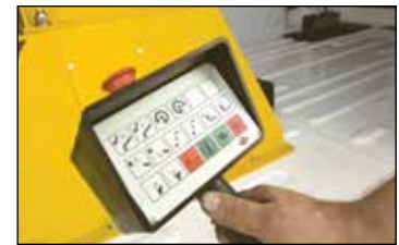
12V DC emergency ground controls