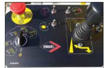
Single joystick control system for improved health and safety