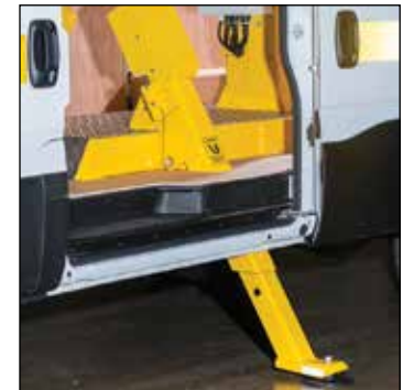
Proven A-frame stabiliser system