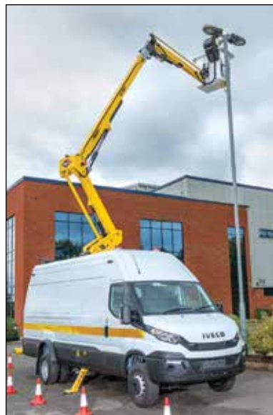
Articulated, telescopic boom maximises the working envelope of the platform

Working envelope at 200kg bucket SWL *Working envelope at 120kg bucket SWL