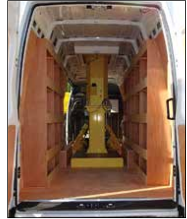
Massive storage and load capacity