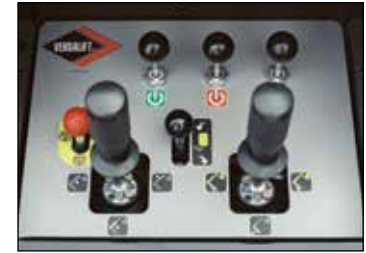
Easy to use fully hydraulic proportional control