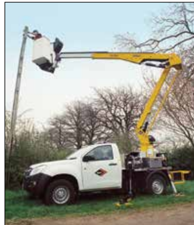
Improved driving experience on-road and impressive off-road capability