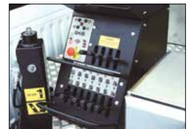
Hydraulic and 12V DC emergency ground controls

The photographs in this brochure are for promotional purposes only. Specifications are subject to change without notice.