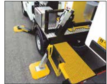
Improved stability via radial outriggers (front) + A-frame outriggers (rear), reducing stress to chassis