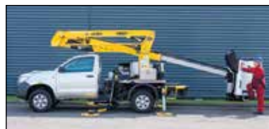
Safe access to bucket from ground