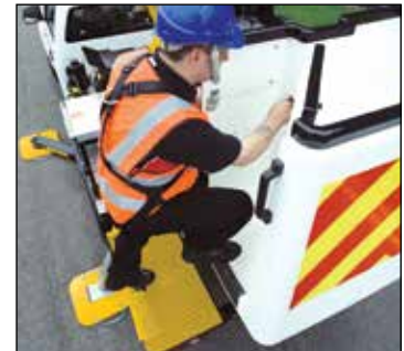
Safe access to bucket from vehicle