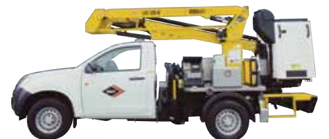
ISUZU D-MAX SINGLE CAB