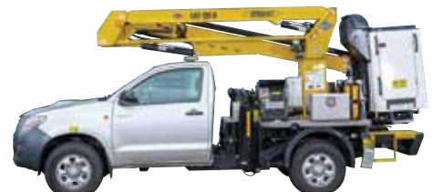
TOYOTA HILUX SINGLE CAB