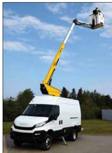
Platform mounted on a 5.2T GVW Iveco Daily 50C