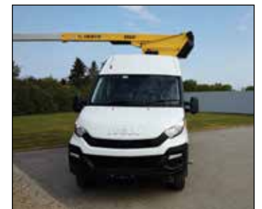
No tail swing outside the mirrors of the vehicle for improved safety