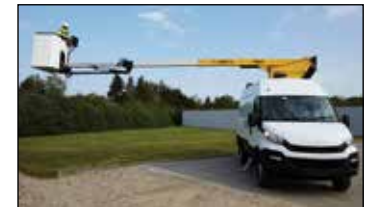
Impressive outreach with LMC load sensing system