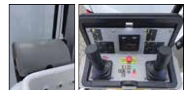
Optional twin joystick IPC control system for enhanced functionality

The photographs in this brochure are for promotional purposes only. Specifications are subject to change without notice.