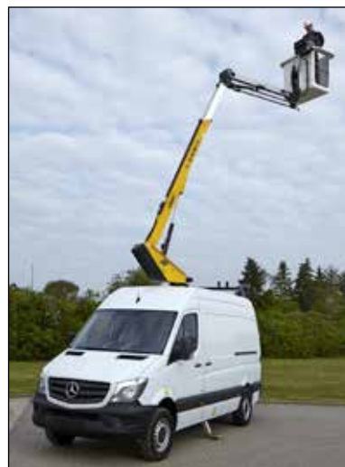
Platform mounted on a 3.5T GVW Mercedes Sprinter with 14.0m working height