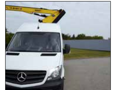
No tail swing outside the mirrors of the vehicle for improved safety