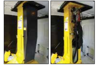
Emergency lowering valves located in pedestal within load area are safe and easy to access