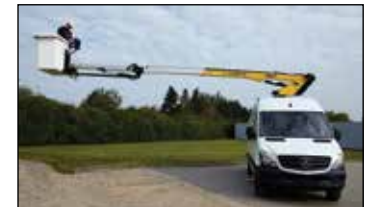
Impressive outreach with LMC sensing system