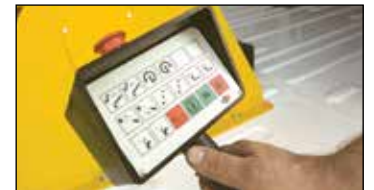
12V DC emergency ground controls