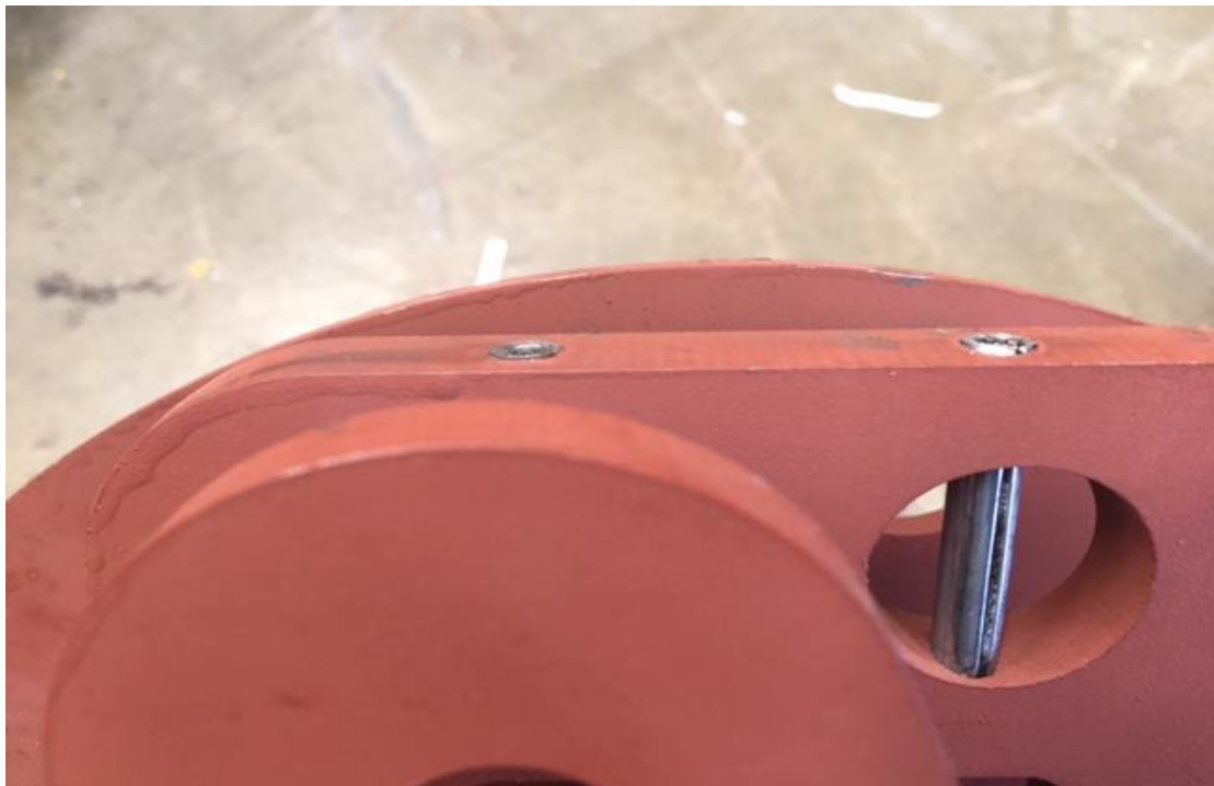
Image above is to highlight how the 2" X 1/4" Spiral Pin should seat in the Quadrant Assembly

Apply Torque Seal to both of the Nut/Bolt/Spacer Assembly as per image.