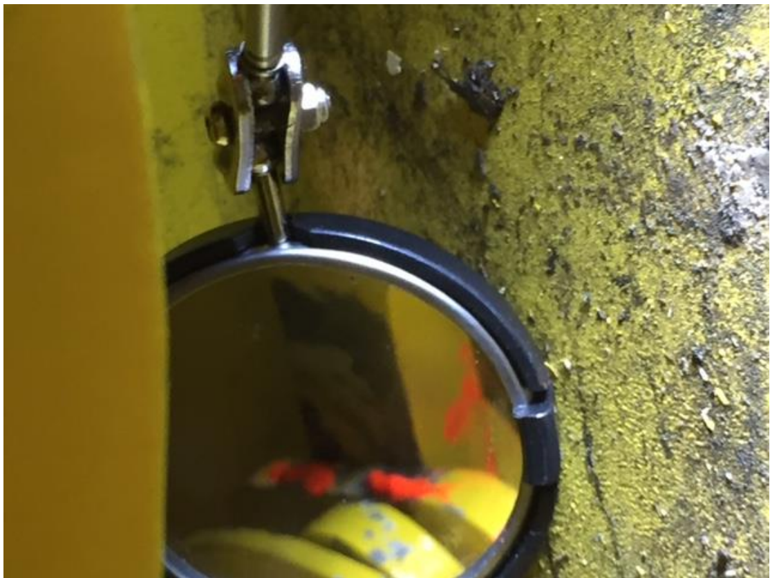
Apply Torque Seal to the 2 Spiral Pins through the Quadrant.