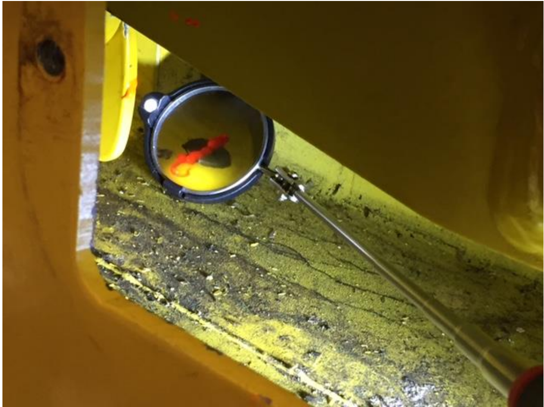
Apply Torque Seal to the Link Pin Assembly.