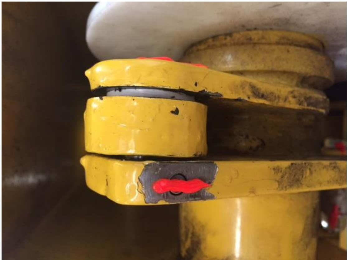
Apply Torque Seal to the Spiral Pin.