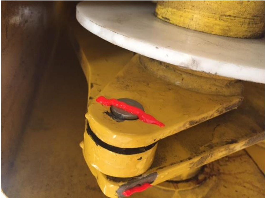
Apply Torque Seal to both sides of the Link Pin.